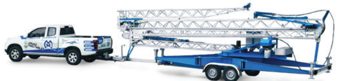
RD: ROAD TRAILER / RD-XP: ROAD EXPRESS TRAILER B+E: MMR 3500 Kg

Diagrama de cargas Load curves Lastkurven Courbes des charges Lasten tabellen Belastnings skema Schemat obciążenia